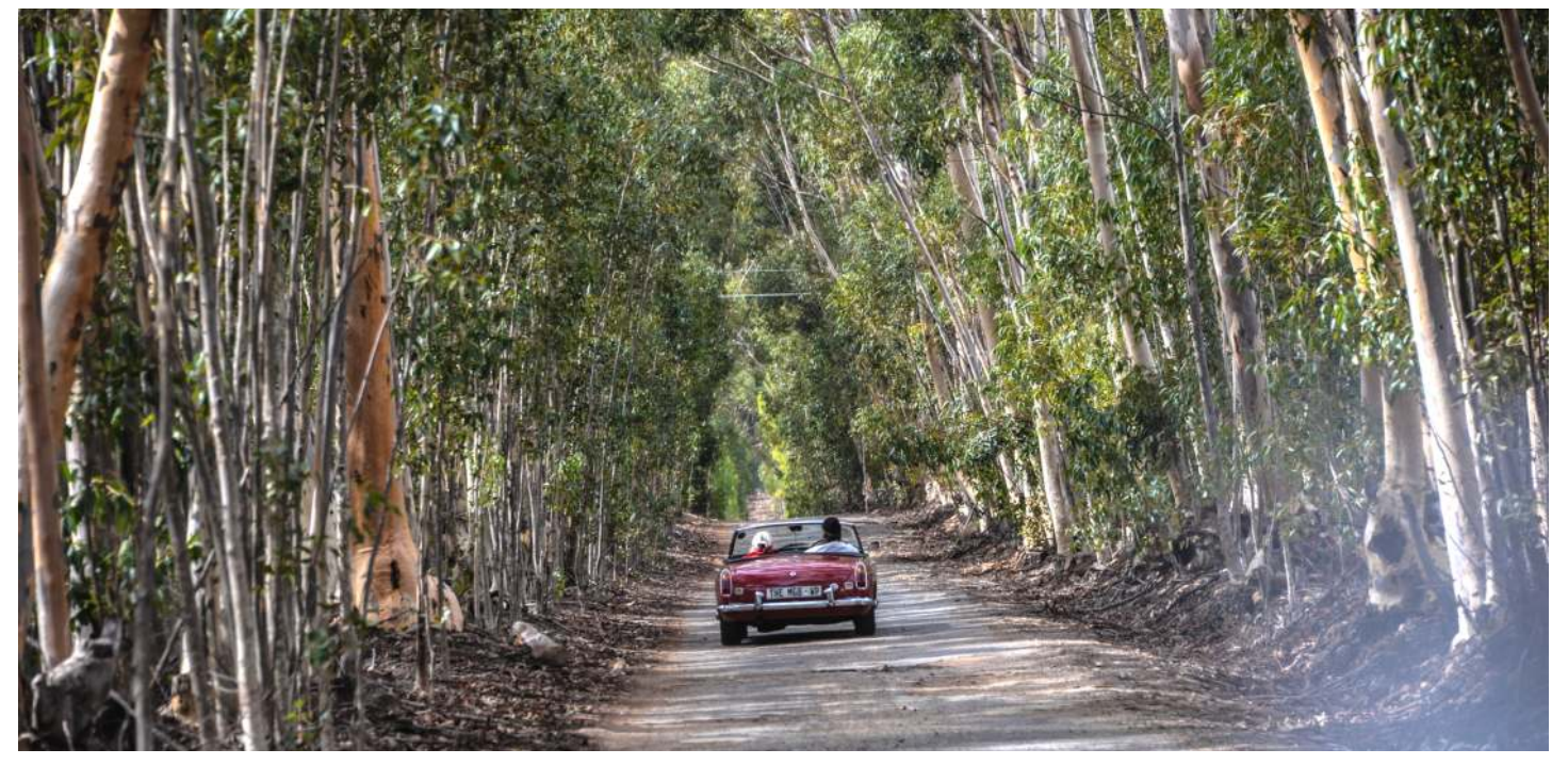
Graham and June Challenger following the massive avenue to lunch at The Bike Forge, outside Tulbagh