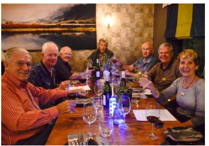
The spirit of the Rally. A jolly good time was had by all.