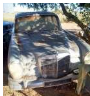
Merc 280 S